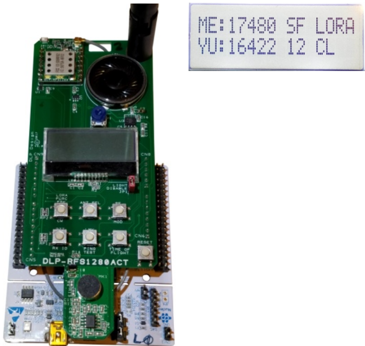
DLP-RFS1280ACT DEMONSTRATION PLATFORM (Serving as a Target for this demonstration)

The system is set up and ready for this demonstration once all Target transceivers are powered and set to LORA Mode. If a Target is set to GFSK or FLRC Mode, simply press Button 1 until “LORA” is shown in the display: