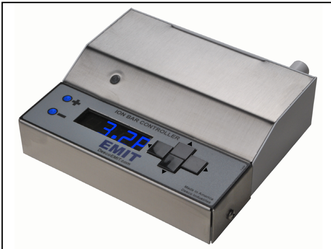
Figure 1. EMIT Pulsed Ion Bar Controller